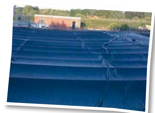
COVERED SLUDGE TANK