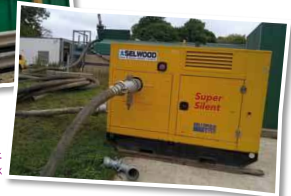
DIESEL PUMP SERVING COVERED TANK