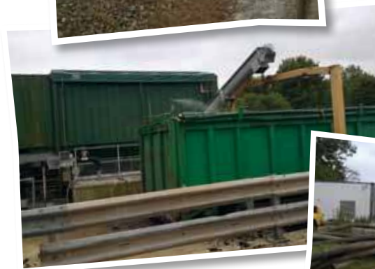
NEW ODOUR SUPPRESSION UNITS ON SKIPS