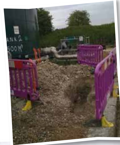
ENABLING WORKS HAVE BEGUN