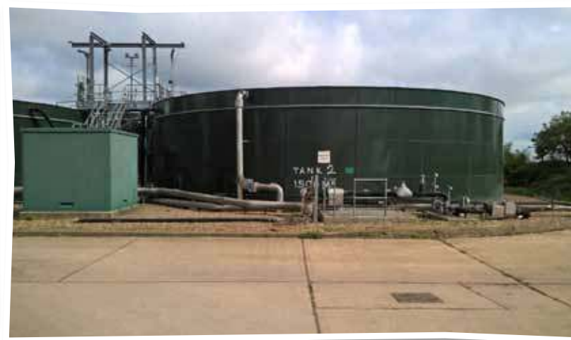
SLUDGE HOLDING TANK